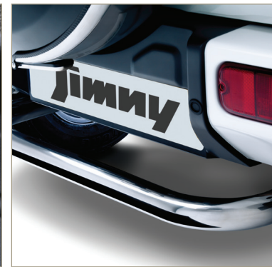
CHROMED REAR SPORT BAR