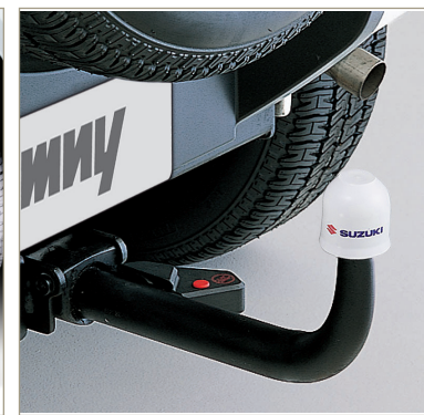
DETACHABLE TOW-BAR ASSEMBLY