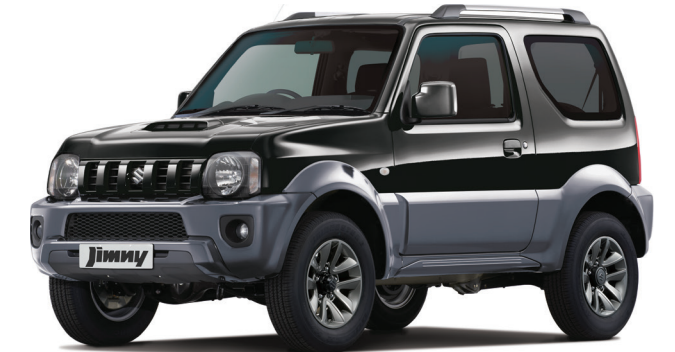
BLUEISH BLACK PEARL METALLIC/ QUASAR GREY 2-TONE†