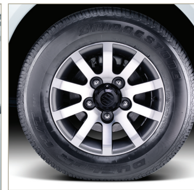
'DAKAR' ALLOY WHEEL