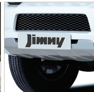
FRONT SKID PLATE