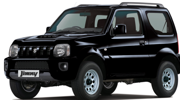
BLUEISH BLACK PEARL METALLIC*