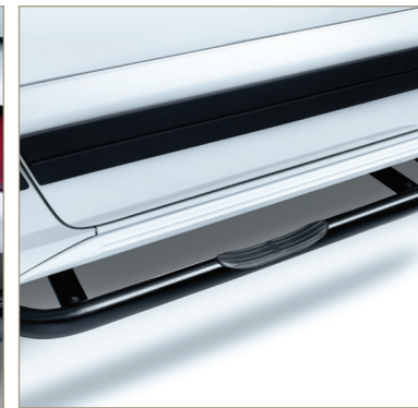
SIDE SPORT BAR SET (BLACK)