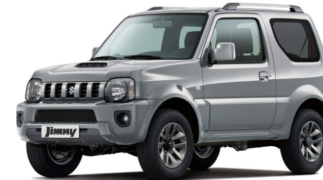
STEEL SILVER METALLIC†