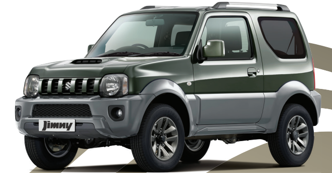
KHAKI GREEN METALLIC/ QUASAR GREY 2-TONE†