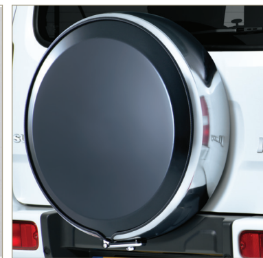
HARD SPARE WHEEL COVER