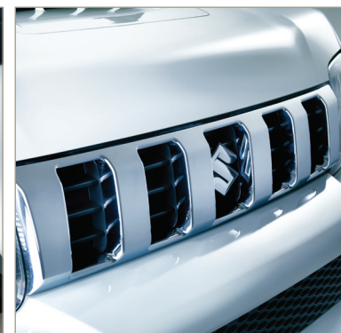
CHROMED FRONT GRILLE TRIM