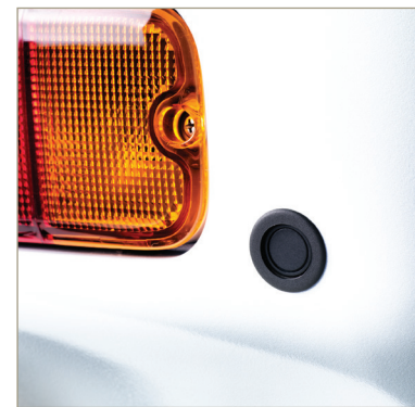
REVERSING AID SENSOR SET