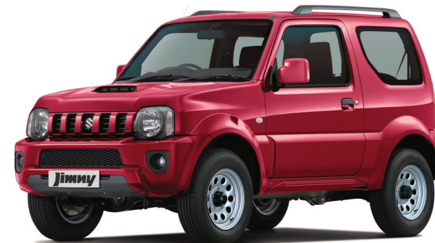
PHOENIX RED PEARL METALLIC*