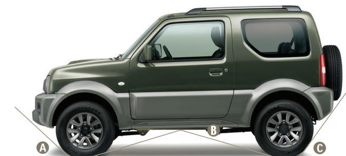
A 34° approach angle (default setting, unloaded Jimny) B 31° ramp breakover angle C 46° departure angle

All year round, the Jimny is a 4x4 designed for adventure. Every time you climb aboard, there's one waiting to happen.