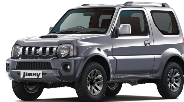
QUASAR GREY METALLIC*†