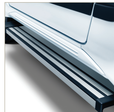
ALUMINIUM RUNNING BOARD

Whether you're down the high street or up a mountain, the Jimny has the versatility to cope. And its range of good-looking, hard-working accessories only makes it better. You'll find all of them on our website. So for once, we're going to suggest you let your fingers do the walking to: suzuki.co.uk/cars/accessories