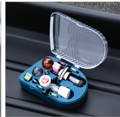
SPARE BULB AND FUSE SET