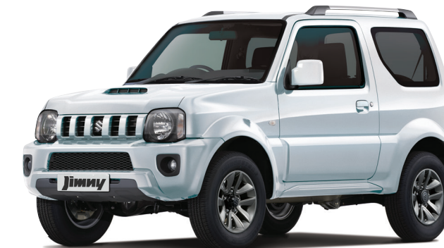
PEARL WHITE METALLIC†