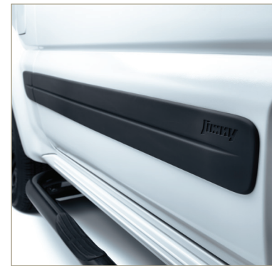
SIDE MOULDING SET