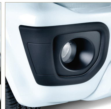
BUMPER CORNER PROTECTOR SET